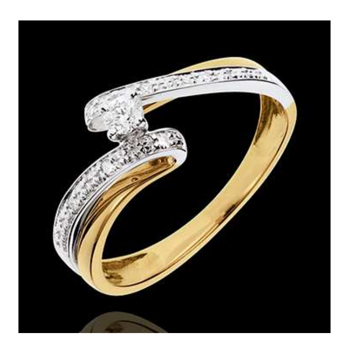
Solar System Ring

<u>See the whole collection >> http://en.edenly.com/universe-collection/</u>