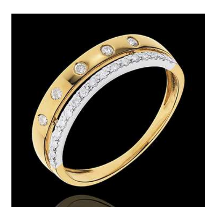
Other Worlds Ring