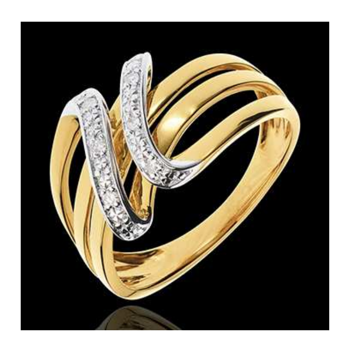
Sounds from Space Ring