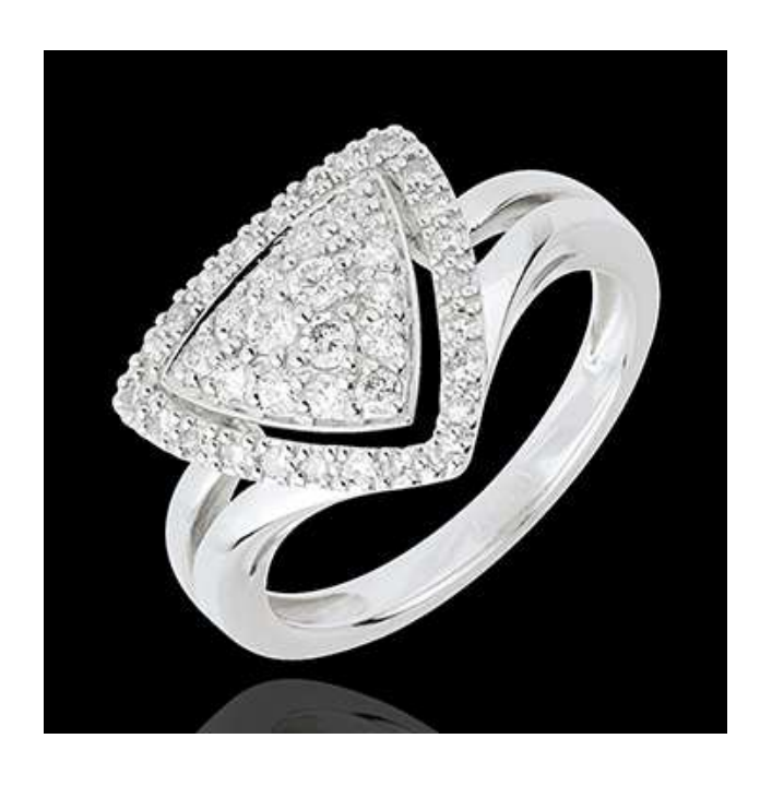
Diamond Spaceship Ring