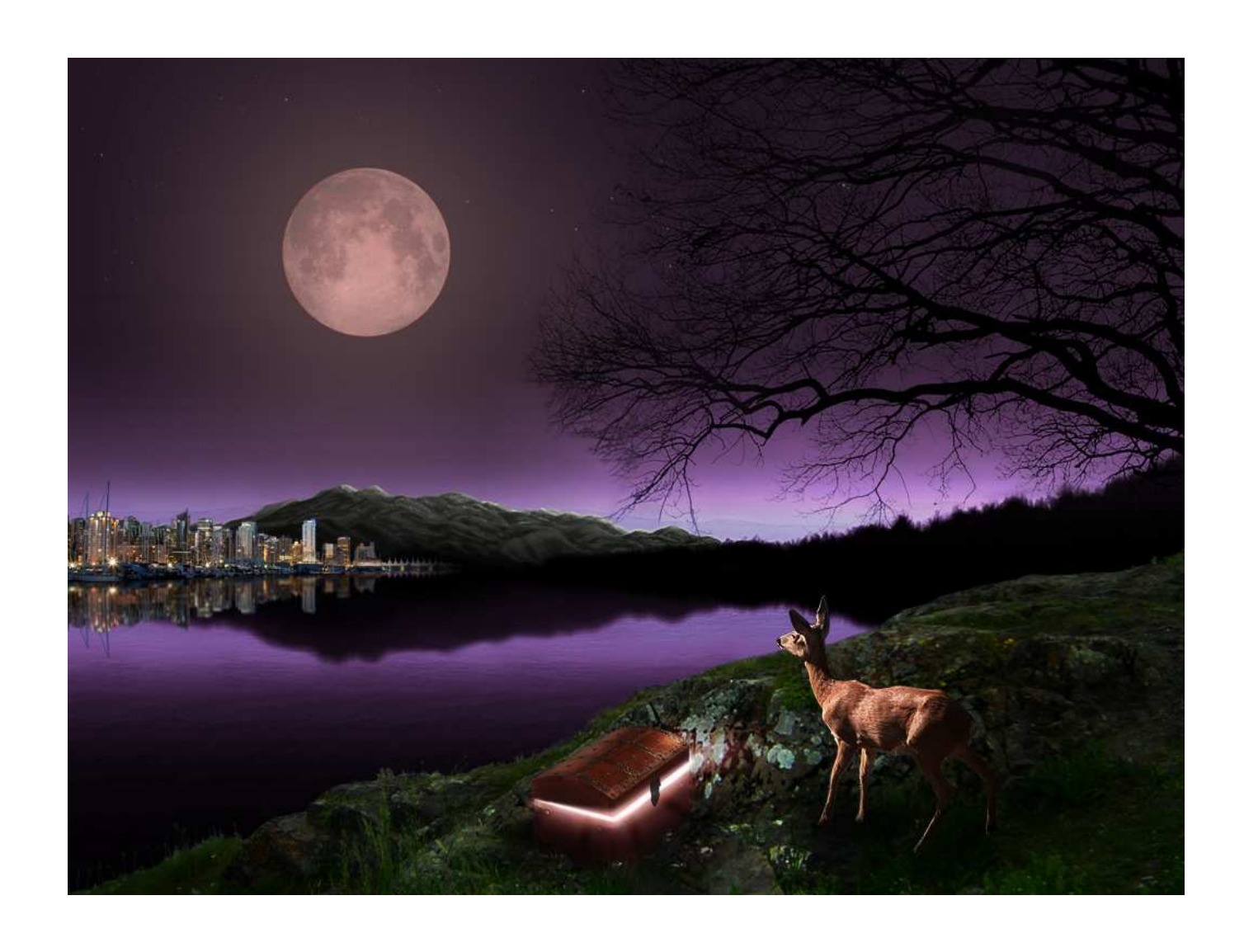
Pink Moon September 2009